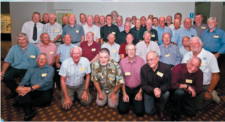
Photo from 2012 Reunion